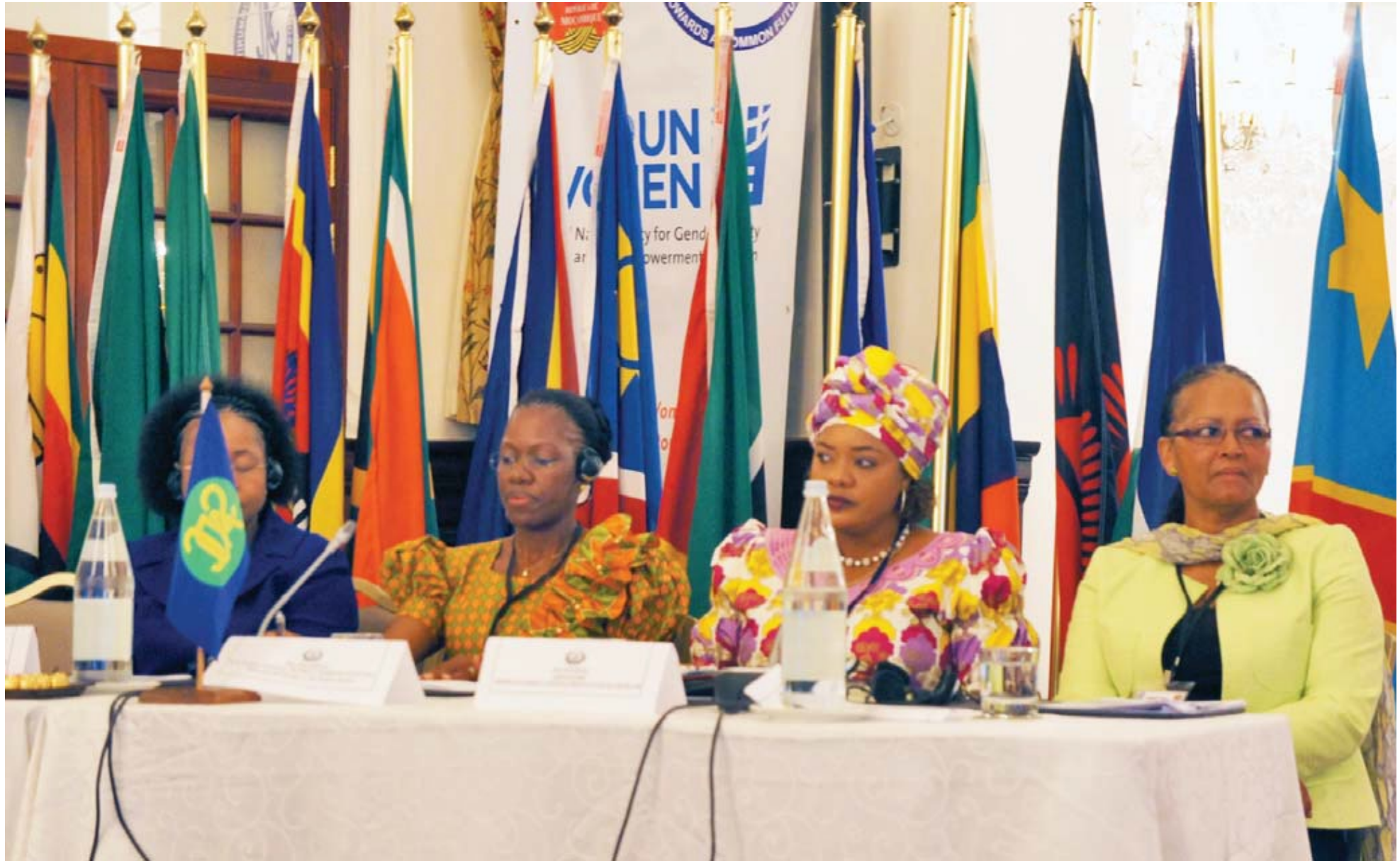
Over to the decision makers to take forward the post 2015 gender and climate change agenda.