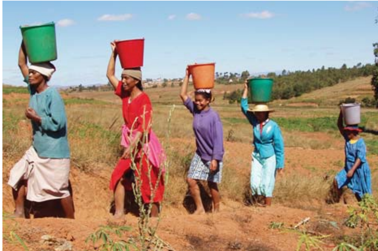
Climate changes mean women throughout the region may have to walk longer distances to fetch water, including these women in Madagascar in 2013.