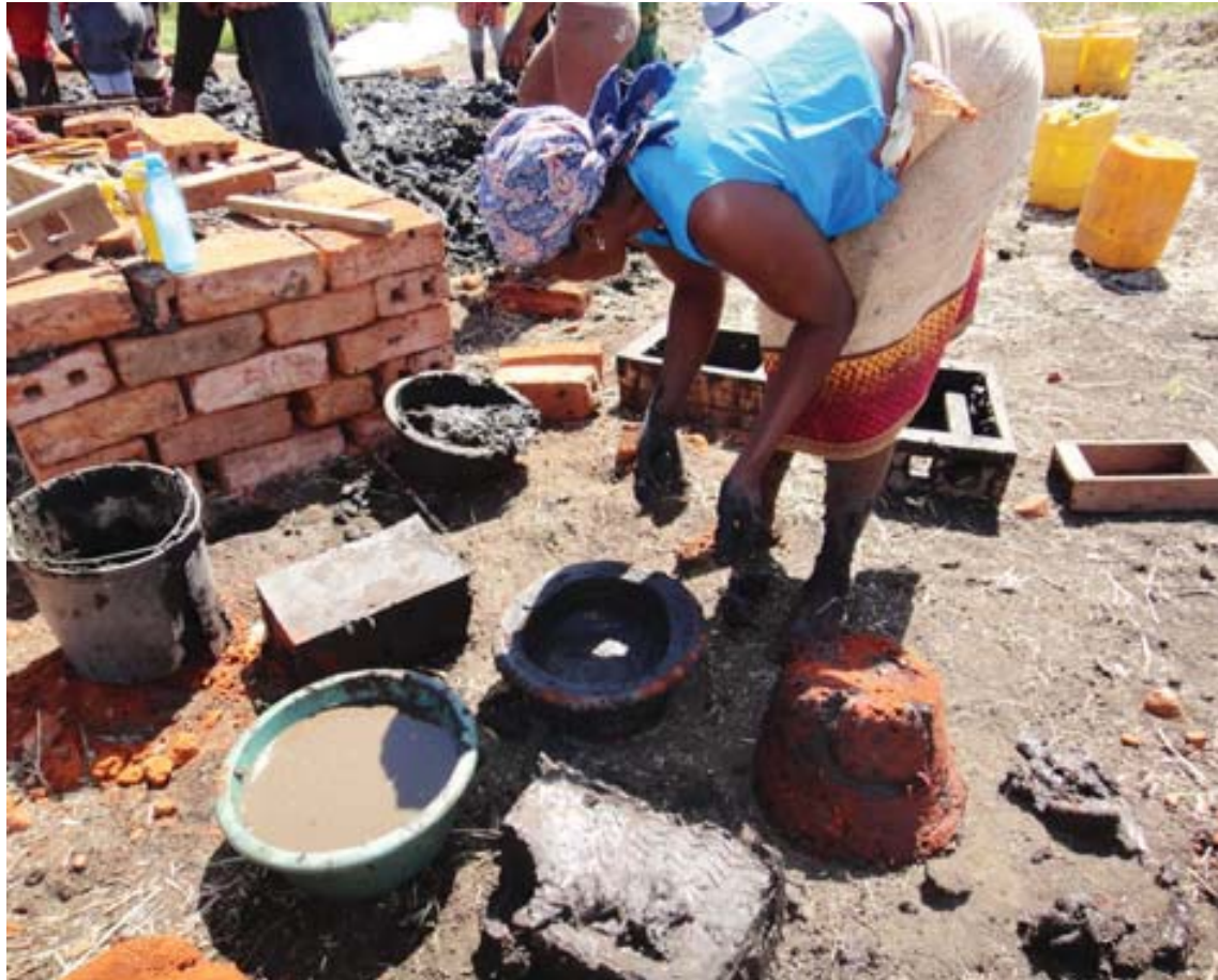
A woman works with clay to create a mud stove in Mozambique.